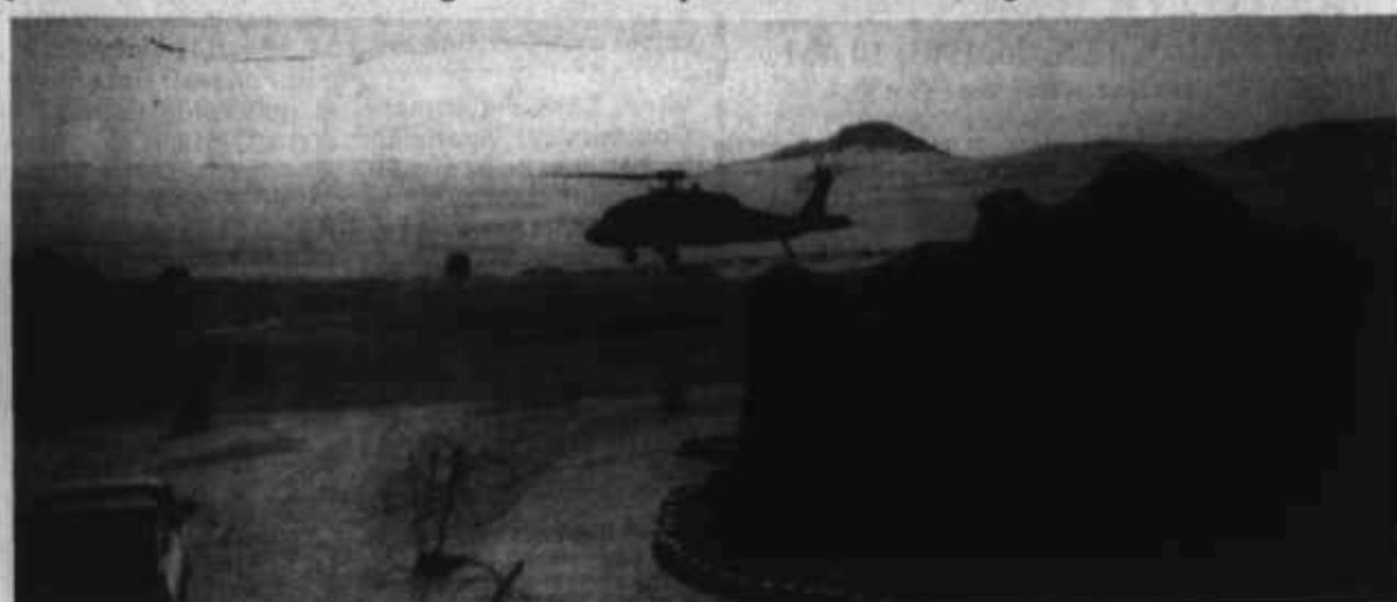
From the Saudi Desert